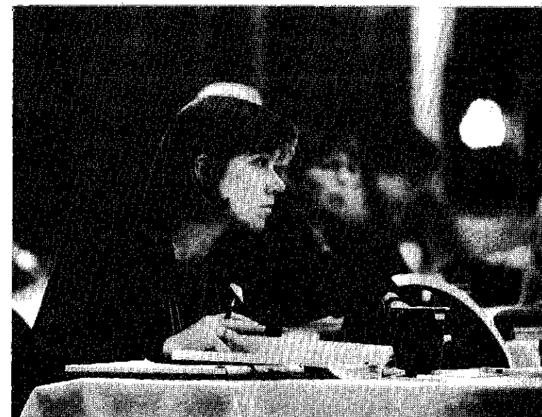
A NOTIS customer listens intently to a presentation.